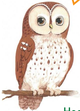
Hootz the tawny owl